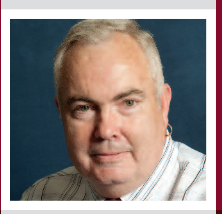
Public Service Delivery, Communities and Prosperity Scrutiny Committee